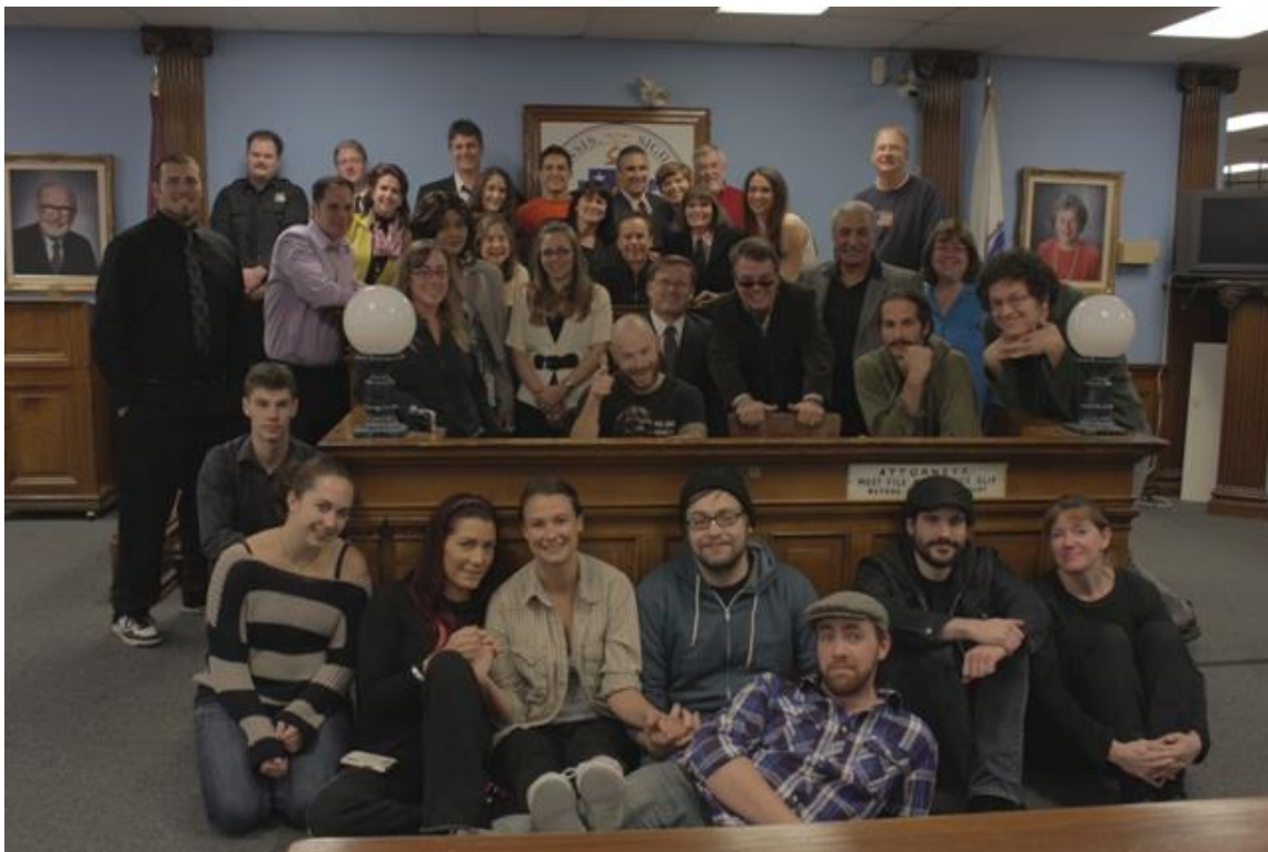
At the Massachusetts School of Law Last day of principal photography on Justice Is Mind October 13, 2012