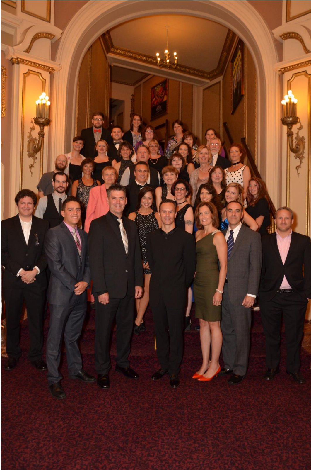
The world premiere of Justice Is Mind on August 18, 2013.